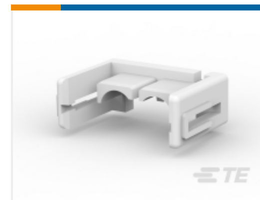
TE Part # 177918-1 POWER DBL LOCK PLATE 2P