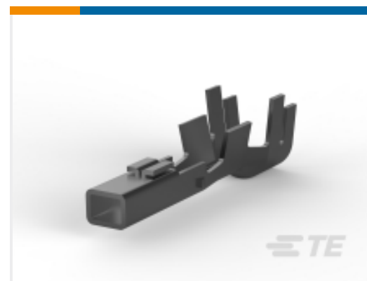
TE Part # CAT-P87024-R2435 Power Double Lock Receptacle