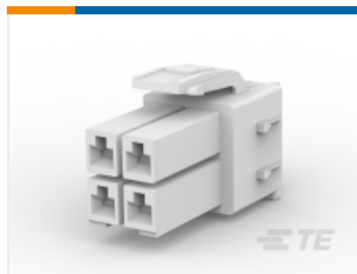
TE Part # 177900-1 POWER DBL LOCK PLUG HSG 4P