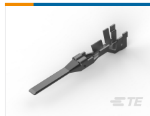
TE Part # CAT-P87024-T111 Power Double Lock Tab